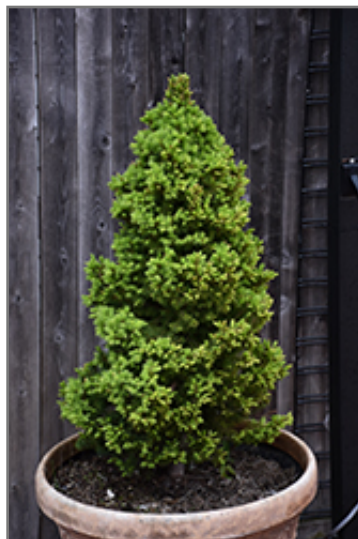
Rainbow's End Spruce