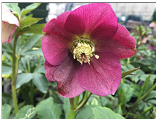
Royal Heritage Hellebore flowers

Royal Heritage Hellebore is recommended for the following landscape applications;