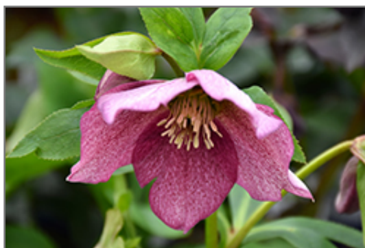
Royal Heritage Hellebore flowers