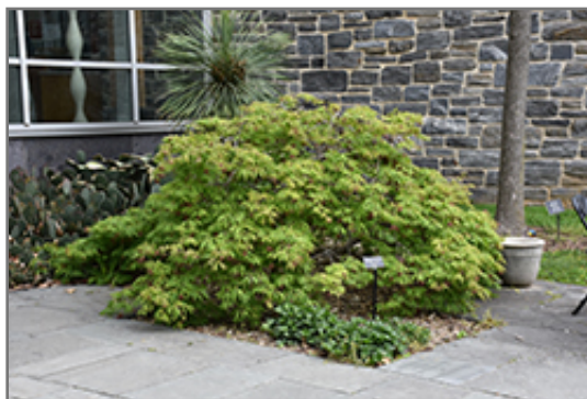
Green Cascade Maple