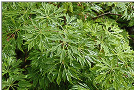
Green Cascade Maple foliage