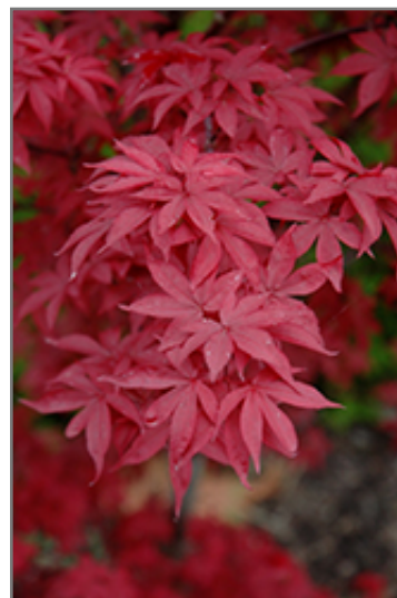
Twombly's Red Sentinel Japanese Maple foliage