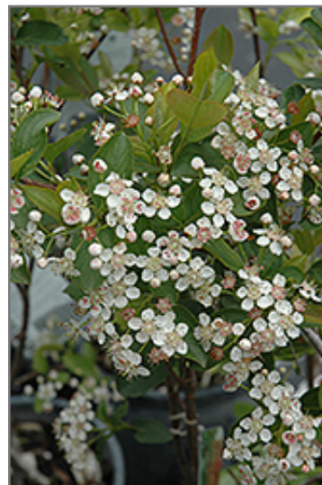
Viking Chokeberry flowers