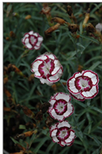
Raspberry Swirl Pinks flowers

Raspberry Swirl Pinks is recommended for the following landscape applications;