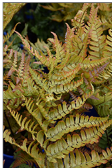
Brilliance Autumn Fern foliage