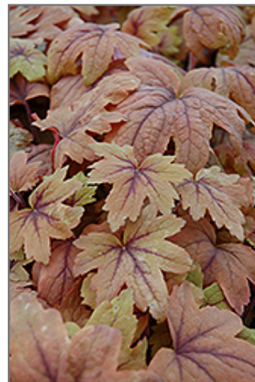
Sweet Tea Foamy Bells foliage