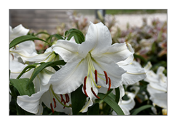
Casa Blanca Lily flowers

A striking hybrid lily producing large downward-facing white blooms, crowning sturdy straight stems that are excellent for cutting; this variety is a good choice to create focal interest in areas around shrubbery or border plantings