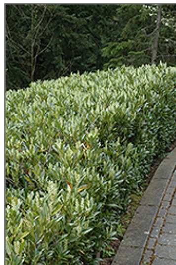
Otto Luyken Dwarf Cherry Laurel in bloom