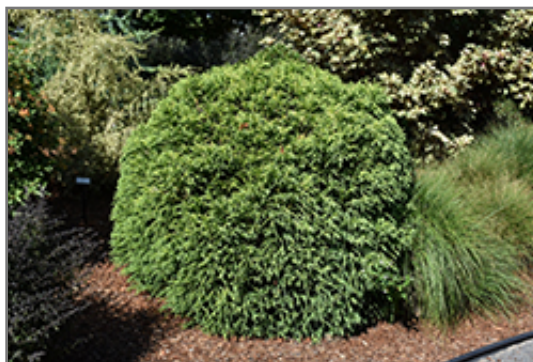
Dwarf Globe Japanese Cedar

Dwarf Globe Japanese Cedar will grow to be about 3 feet tall at maturity, with a spread of 3 feet. It tends to fill out right to the ground and therefore doesn't necessarily require facer plants in front. It grows at a slow rate, and under ideal conditions can be expected to live for 40 years or more.