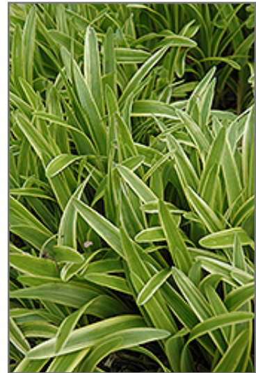
Variegata Lily Turf foliage

This plant does best in partial shade to shade. It does best in average to evenly moist conditions, but will not tolerate standing water. It is not particular as to soil type or pH. It is somewhat tolerant of urban pollution. This is a selected variety of a species not originally from North America. It can be propagated by division; however, as a cultivated variety, be aware that it may be subject to certain restrictions or prohibitions on propagation.