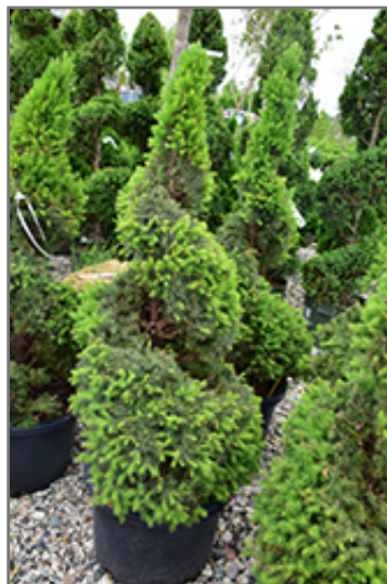
Dwarf Alberta Spruce (topiary form)