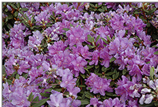
Purple Gem Rhododendron flowers