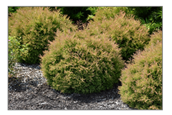
Fire Chief Arborvitae

Fire Chief Arborvitae will grow to be about 5 feet tall at maturity, with a spread of 5 feet. It tends to fill out right to the ground and therefore doesn't necessarily require facer plants in front, and is suitable for planting under power lines. It grows at a slow rate, and under ideal conditions can be expected to live for approximately 30 years.