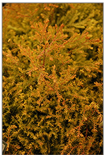
Fire Chief Arborvitae foliage

Fire Chief Arborvitae is recommended for the following landscape applications;