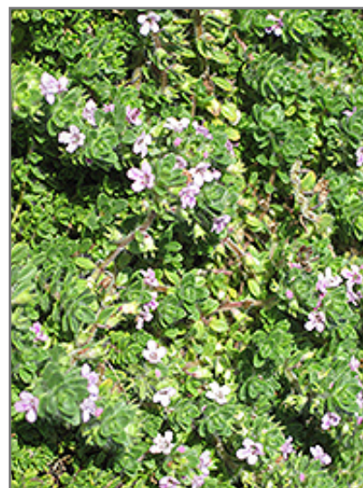
Pink Chintz Creeping Thyme flowers