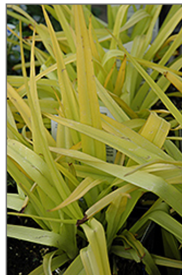
Sunshine Charm Spiderwort foliage

Sunshine Charm Spiderwort is recommended for the following landscape applications;