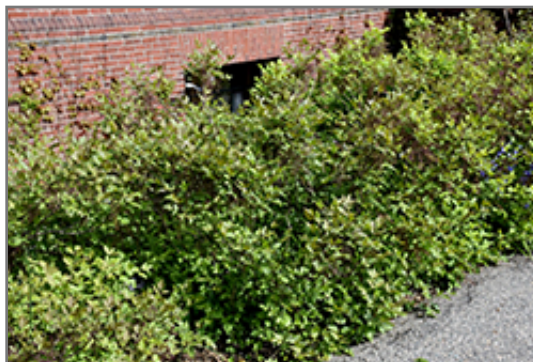
Shrub Yellowroot