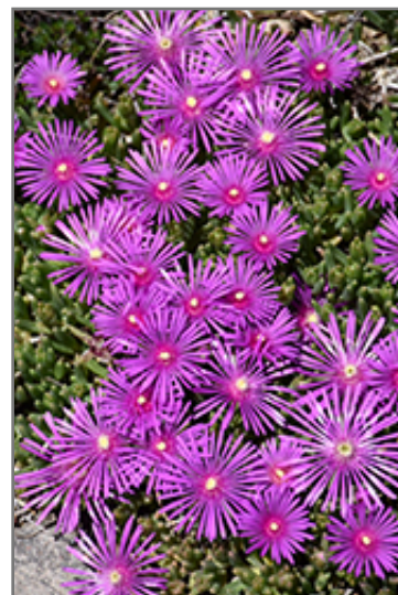
Purple Ice Plant flowers

Purple Ice Plant is recommended for the following landscape applications;