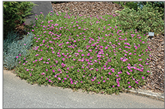
Purple Ice Plant in bloom

Purple Ice Plant will grow to be only 2 inches tall at maturity extending to 3 inches tall with the flowers, with a spread of 24 inches. Its foliage tends to remain low and dense right to the ground. It grows at a fast rate, and under ideal conditions can be expected to live for approximately 5 years. As an evergreen perennial, this plant will typically keep its form and foliage year-round.