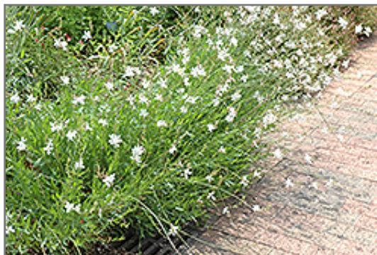
Whirling Butterflies Gaura in bloom