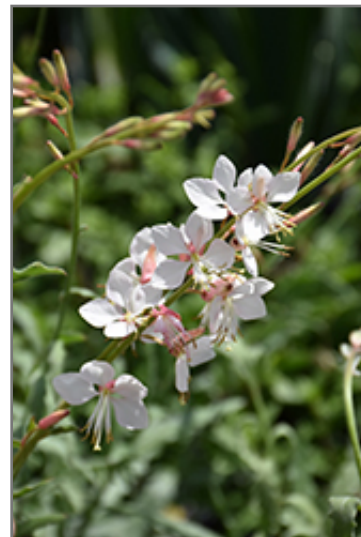
Whirling Butterflies Gaura flowers

This is a relatively low maintenance plant, and is best cleaned up in early spring before it resumes active growth for the season. It is a good choice for attracting butterflies to your yard, but is not particularly attractive to deer who tend to leave it alone in favor of tastier treats. It has no significant negative characteristics.