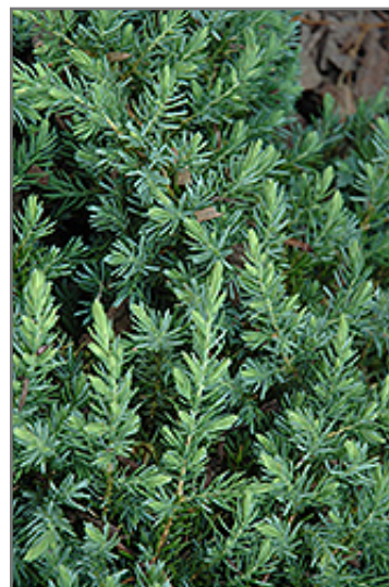
Blue Pacific Shore Juniper foliage