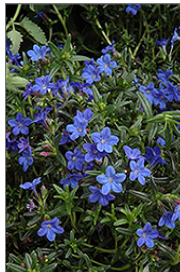
Grace Ward Lithodora flowers