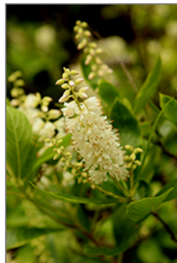
Summersweet flowers

Summersweet is recommended for the following landscape applications;