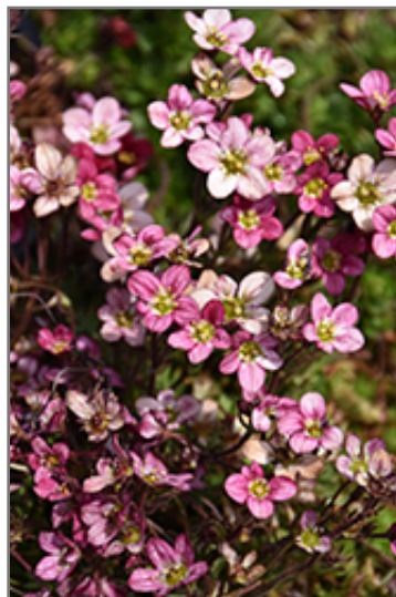
Purple Robe Saxifrage flowers