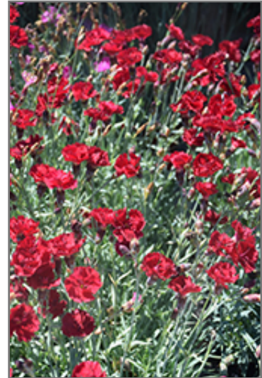
Fire Star Pinks flowers

Fire Star Pinks will grow to be about 8 inches tall at maturity, with a spread of 8 inches. When grown in masses or used as a bedding plant, individual plants should be spaced approximately 6 inches apart. Its foliage tends to remain low and dense right to the ground. It grows at a medium rate, and under ideal conditions can be expected to live for approximately 10 years. As an evergreen perennial, this plant will typically keep its form and foliage year-round.