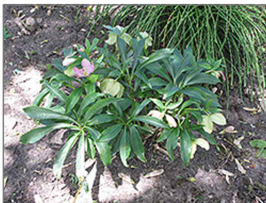
Winter Jewels Cherry Blossom Hellebore in bloom