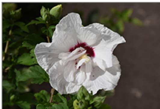
Bali Rose of Sharon flowers

Bali Rose of Sharon is recommended for the following landscape applications;