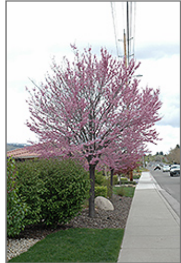
Eastern Redbud (tree form) in bloom

This tree does best in full sun to partial shade. It prefers to grow in average to moist conditions, and shouldn't be allowed to dry out. It is not particular as to soil type or pH. It is highly tolerant of urban pollution and will even thrive in inner city environments, and will benefit from being planted in a relatively sheltered location. Consider applying a thick mulch around the root zone in winter to protect it in exposed locations or colder microclimates. This is a selection of a native North American species.