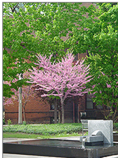
Eastern Redbud (tree form) in bloom