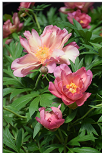
Julia Rose Peony flowers