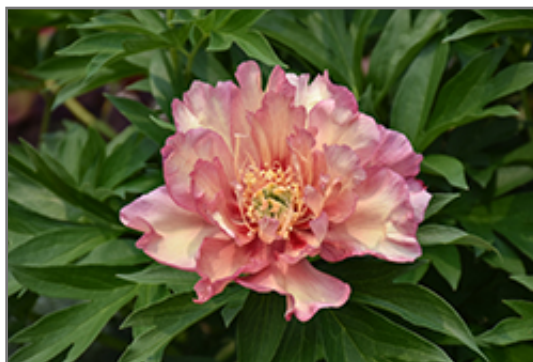
Julia Rose Peony flowers

Julia Rose Peony is recommended for the following landscape applications;