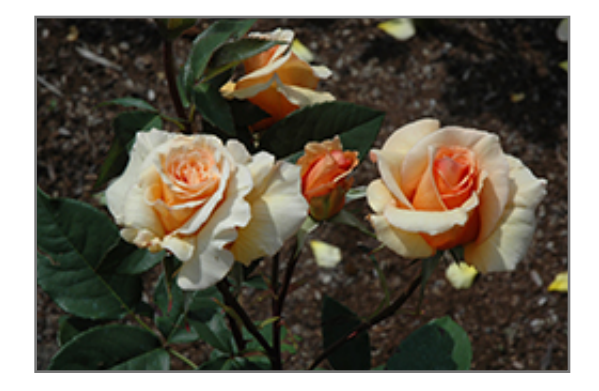
Brandy Rose flowers