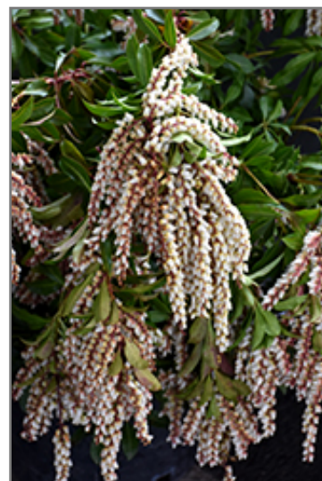
Mountain Fire Japanese Pieris flowers