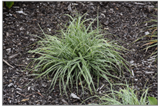
EverColor Everest Japanese Sedge

EverColor Everest Japanese Sedge will grow to be about 16 inches tall at maturity, with a spread of 16 inches. Its foliage tends to remain dense right to the ground, not requiring facer plants in front. It grows at a medium rate, and under ideal conditions can be expected to live for approximately 10 years. As an evergreen perennial, this plant will typically keep its form and foliage year-round.