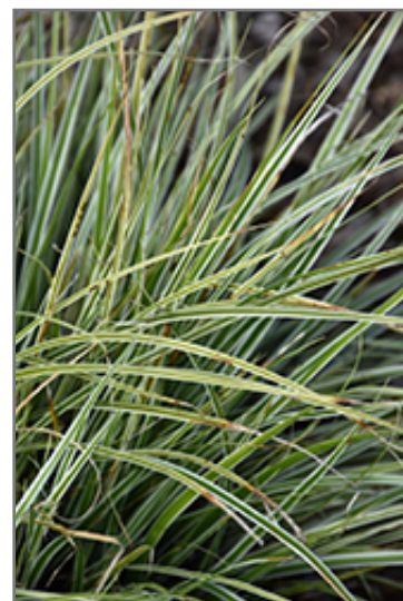
EverColor Everest Japanese Sedge foliage