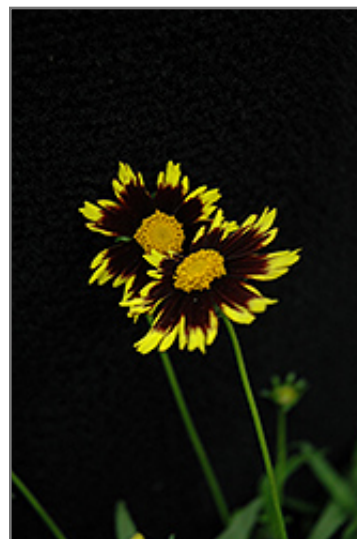
Cosmic Eye Tickseed flowers

Cosmic Eye Tickseed is recommended for the following landscape applications;