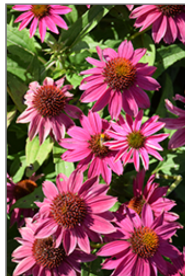
PowWow Wild Berry Coneflower flowers