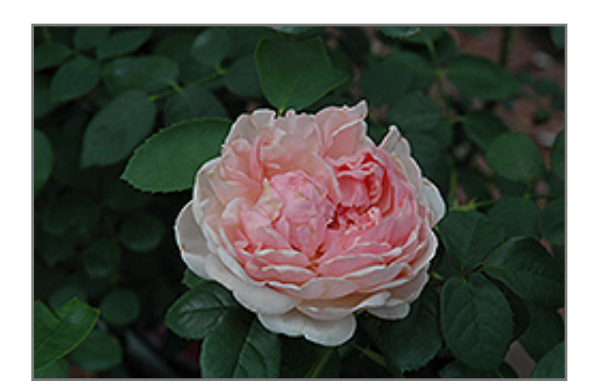
St. Swithun Rose flowers