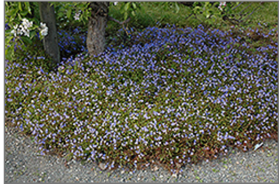
Georgia Blue Speedwell in bloom

Georgia Blue Speedwell will grow to be only 4 inches tall at maturity extending to 6 inches tall with the flowers, with a spread of 24 inches. When grown in masses or used as a bedding plant, individual plants should be spaced approximately 18 inches apart. Its foliage tends to remain low and dense right to the ground. It grows at a fast rate, and under ideal conditions can be expected to live for approximately 10 years. As an herbaceous perennial, this plant will usually die back to the crown each winter, and will regrow from the base each spring. Be careful not to disturb the crown in late winter when it may not be readily seen!