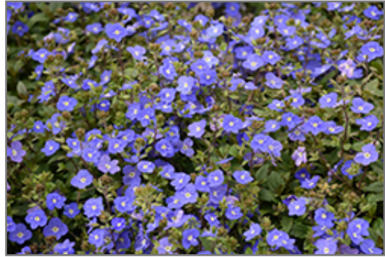
Georgia Blue Speedwell flowers

This is a relatively low maintenance plant, and is best cleaned up in early spring before it resumes active growth for the season. It is a good choice for attracting butterflies to your yard, but is not particularly attractive to deer who tend to leave it alone in favor of tastier treats. It has no significant negative characteristics.