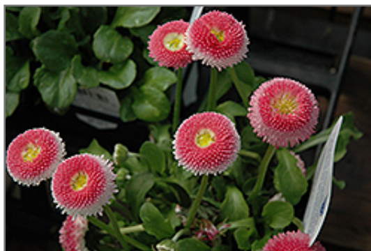
Bellisima Pink English Daisy flowers

Bellisima Pink English Daisy is recommended for the following landscape applications;