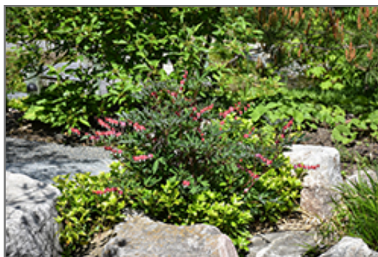
Valentine Bleeding Heart in bloom