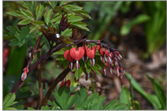
Valentine Bleeding Heart flowers

Valentine Bleeding Heart will grow to be about 30 inches tall at maturity, with a spread of 28 inches. When grown in masses or used as a bedding plant, individual plants should be spaced approximately 24 inches apart. It grows at a medium rate, and under ideal conditions can be expected to live for approximately 15 years. As an herbaceous perennial, this plant will usually die back to the crown each winter, and will regrow from the base each spring. Be careful not to disturb the crown in late winter when it may not be readily seen! As this plant tends to go dormant in summer, it is best interplanted with late-season bloomers to hide the dying foliage.