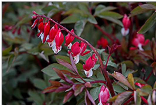
Valentine Bleeding Heart flowers

Valentine Bleeding Heart is recommended for the following landscape applications;