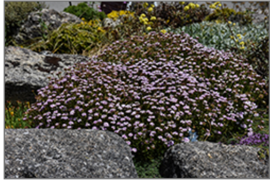
Pink Ice Candytuft in bloom

Pink Ice Candytuft will grow to be only 6 inches tall at maturity extending to 8 inches tall with the flowers, with a spread of 24 inches. When grown in masses or used as a bedding plant, individual plants should be spaced approximately 18 inches apart. Its foliage tends to remain low and dense right to the ground. It grows at a fast rate, and under ideal conditions can be expected to live for approximately 10 years. As an evergreen perennial, this plant will typically keep its form and foliage year-round.