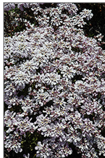
Pink Ice Candytuft flowers