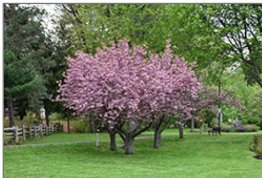
Kwanzan Flowering Cherry in bloom