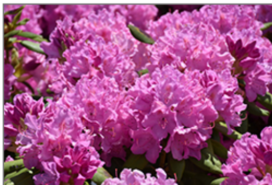
Roseum Elegans Rhododendron flowers