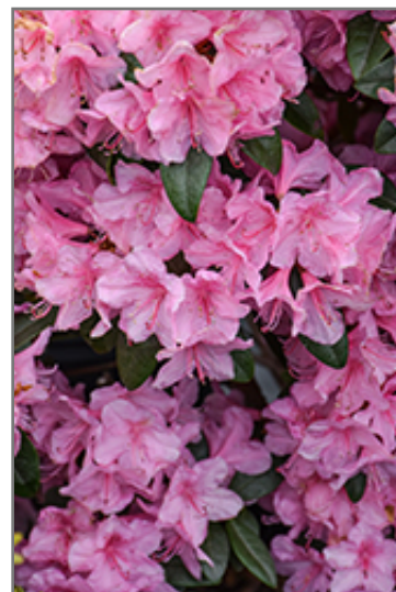
Aglo Rhododendron flowers