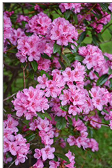
Aglo Rhododendron flowers

Aglo Rhododendron makes a fine choice for the outdoor landscape, but it is also well-suited for use in outdoor pots and containers. Because of its height, it is often used as a 'thriller' in the 'spiller-thriller-filler' container combination; plant it near the center of the pot, surrounded by smaller plants and those that spill over the edges. It is even sizeable enough that it can be grown alone in a suitable container. Note that when grown in a container, it may not perform exactly as indicated on the tag - this is to be expected. Also note that when growing plants in outdoor containers and baskets, they may require more frequent waterings than they would in the yard or garden.