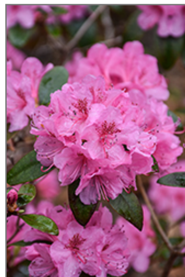
Olga Mezitt Rhododendron flowers