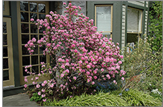
Olga Mezitt Rhododendron in bloom

This shrub does best in full sun to partial shade. You may want to keep it away from hot, dry locations that receive direct afternoon sun or which get reflected sunlight, such as against the south side of a white wall. It requires an evenly moist well-drained soil for optimal growth, but will die in standing water. It is very fussy about its soil conditions and must have rich, acidic soils to ensure success, and is subject to chlorosis (yellowing) of the foliage in alkaline soils. It is somewhat tolerant of urban pollution, and will benefit from being planted in a relatively sheltered location. Consider applying a thick mulch around the root zone in winter to protect it in exposed locations or colder microclimates. This particular variety is an interspecific hybrid.