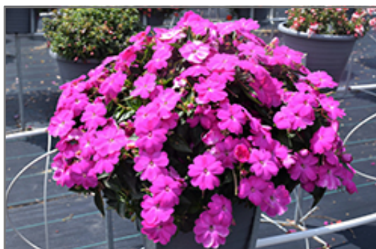
SunPatiens Compact Lilac New Guinea Impatiens in bloom