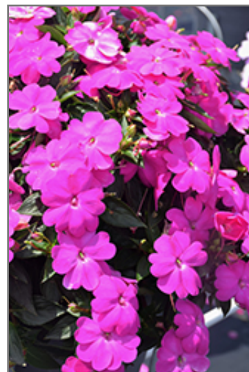
SunPatiens Compact Lilac New Guinea Impatiens flowers

This plant will require occasional maintenance and upkeep, and should not require much pruning, except when necessary, such as to remove dieback. It is a good choice for attracting bees and butterflies to your yard. It has no significant negative characteristics.