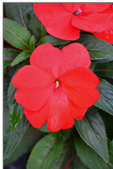
Super Sonic Red New Guinea Impatiens flowers

Super Sonic Red New Guinea Impatiens is recommended for the following landscape applications;