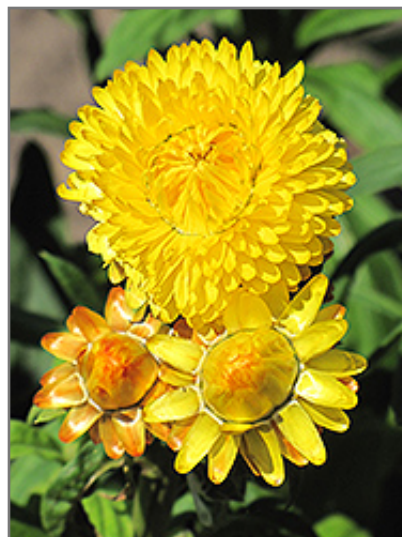
Dreamtime Jumbo Yellow Strawflower flowers