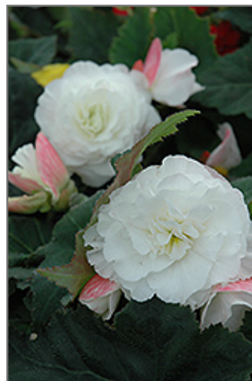
Nonstop Appleblossom Begonia flowers

Nonstop Appleblossom Begonia is recommended for the following landscape applications;