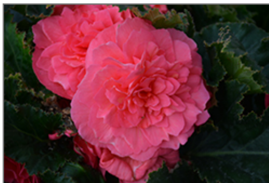
Nonstop Pink Begonia flowers

Nonstop Pink Begonia is recommended for the following landscape applications;