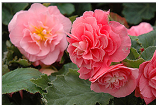
Nonstop Pink Begonia flowers