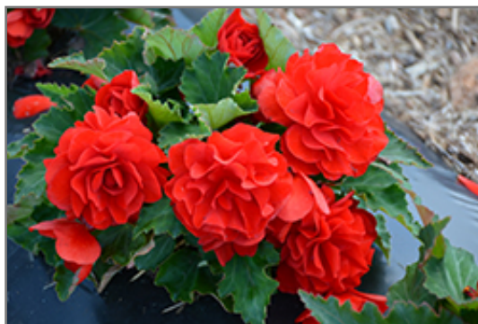
Nonstop Red Begonia in bloom

Nonstop Red Begonia is recommended for the following landscape applications;