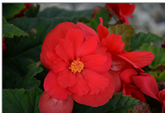
Nonstop Red Begonia flowers