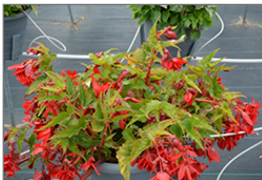
Illumination Scarlet Begonia in bloom