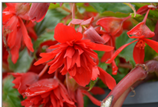
Illumination Scarlet Begonia flowers

Illumination Scarlet Begonia is recommended for the following landscape applications;